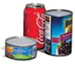
Aluminum and Steel Cans (empty, rinse)