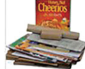
Cereal Boxes, Newspaper, Magazines and Mail, Flattened Cardboard & Paper tubes