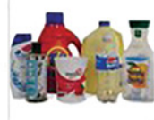
Kitchen, Laundry, Bath Plastic Bottles, Jugs & Tubs (empty, rinse, replace cap)