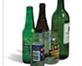
Bottles and Jars (empty, rinse)