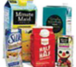
Food and Beverage Cartons (empty, rinse, replace cap)